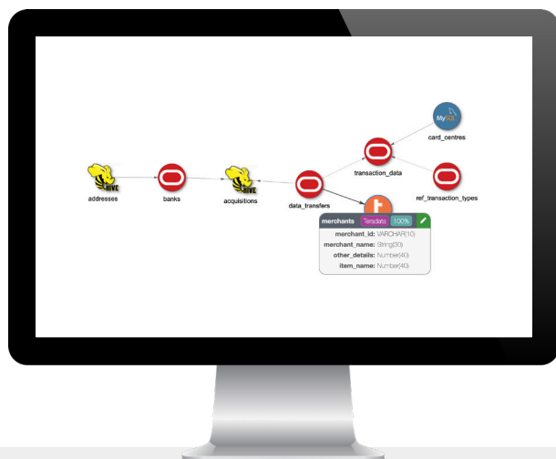
Figure 1. Data Map: Visualize relationships across vendors / types / systems. Automatically generated and fully editable. Integrate with Collibra to use curated data.